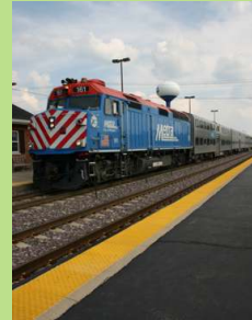
Downtown Harvard Streetscape