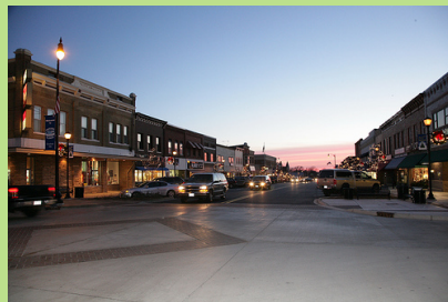
Downtown Harvard Streetscape at Night