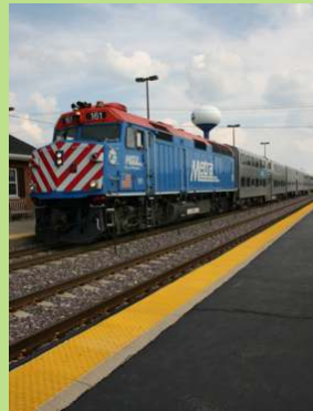
Street View of Site (seeded area) ... Close to Metra station