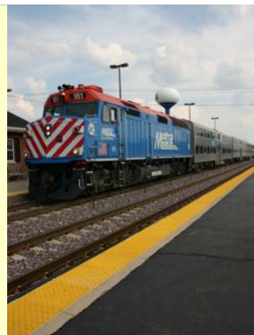
Street View of Site (seeded area) ... Close to Metra station