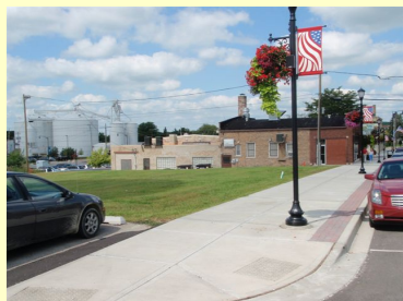
Street View of Site (seeded area) ... Close to Metra station